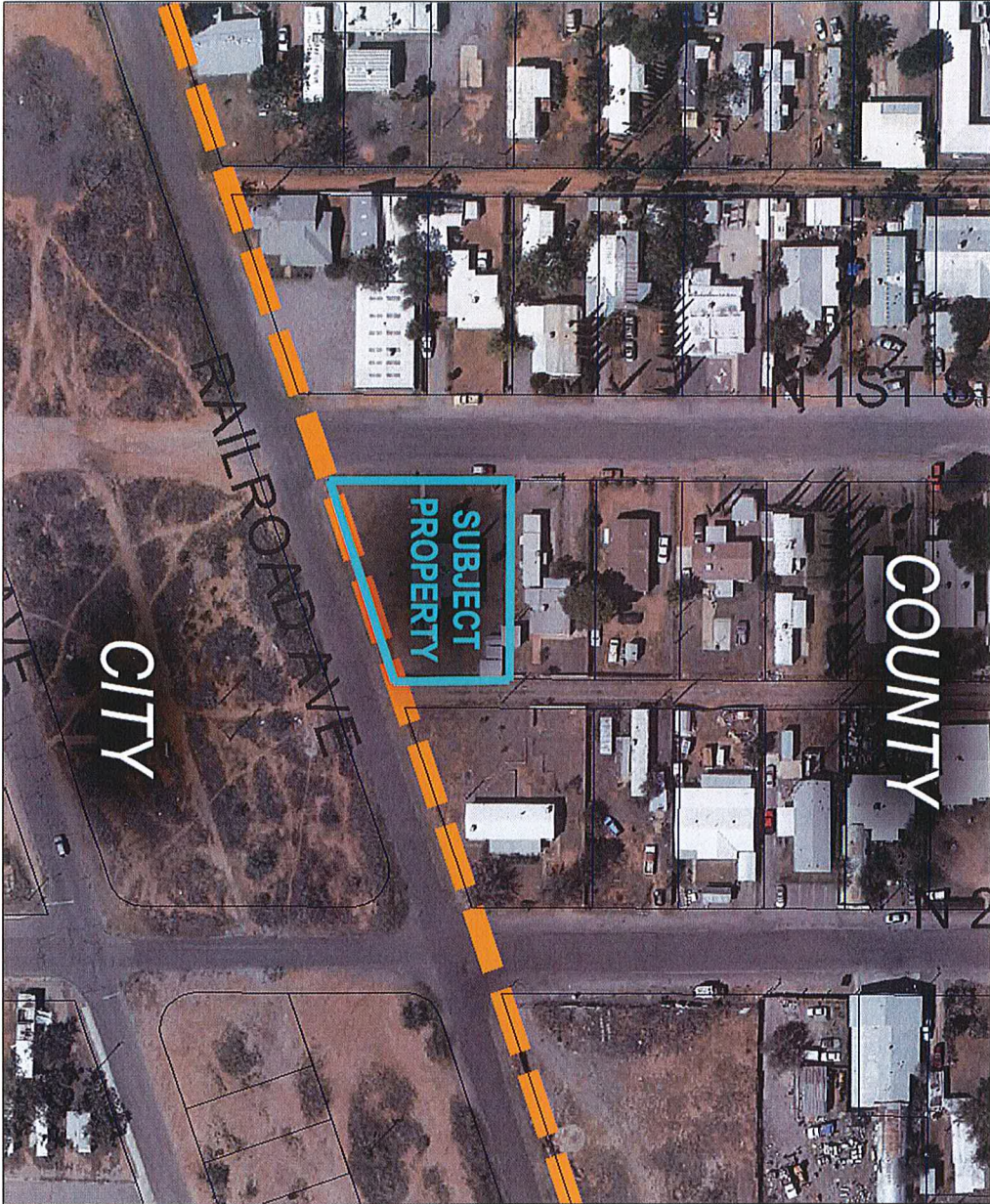
Exhibit A (map)