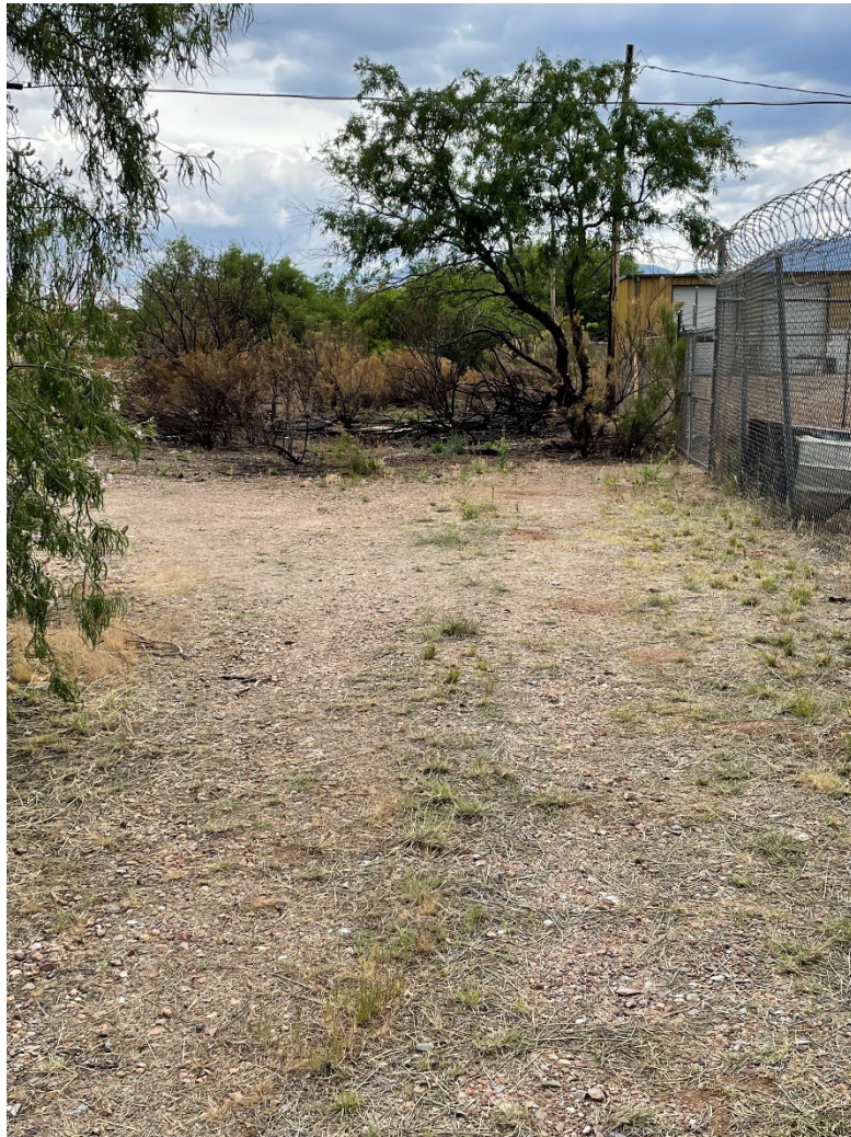
Alley 2- looking south from Cyr Center. The unmaintained vegetation makes the alleyway untraversable.