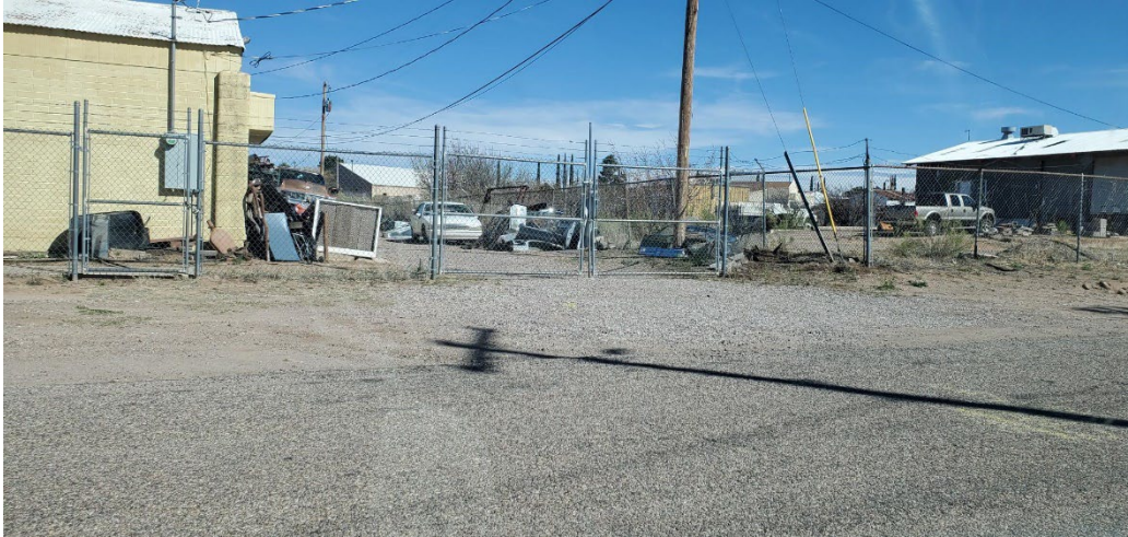
Alley 1- looking east from North Ave. Notice the gate and storage of materials. The power poles in the alleyway can be viewed.