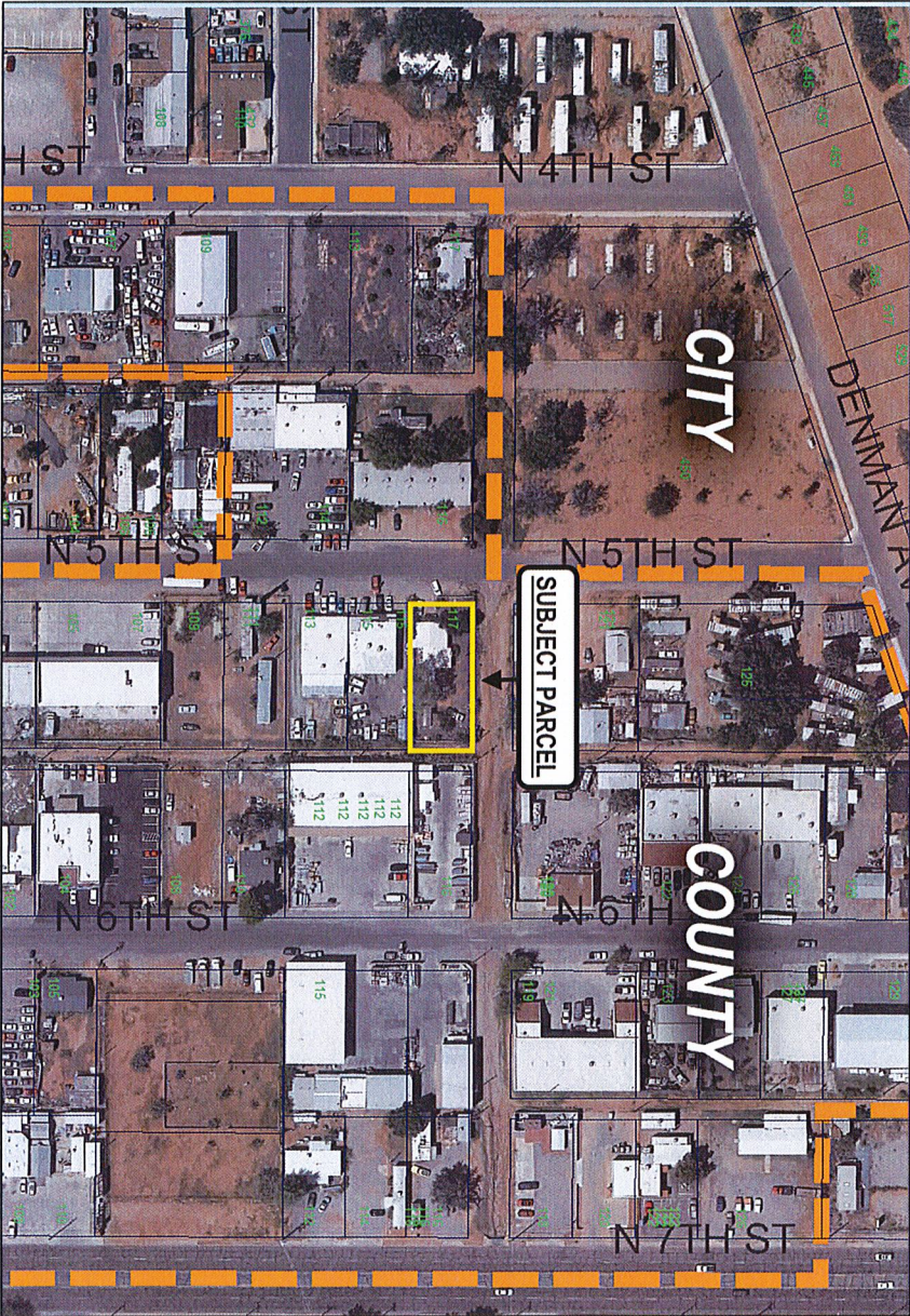
Exhibit A (map)