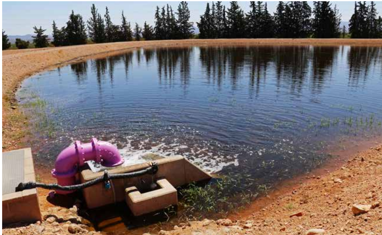
Did you know the City has recharged more than 10 billion gallons of treated effluent at its Environmental Operations Park since the City's wastewater treatment facility first opened in 2002?

Vista 2040 will be divided into the following five sections: Community Growth and Development, Economic Vitality, Connectivity, Public Facilities and Services, and Economic Sustainability. Let's learn a little more about each one.