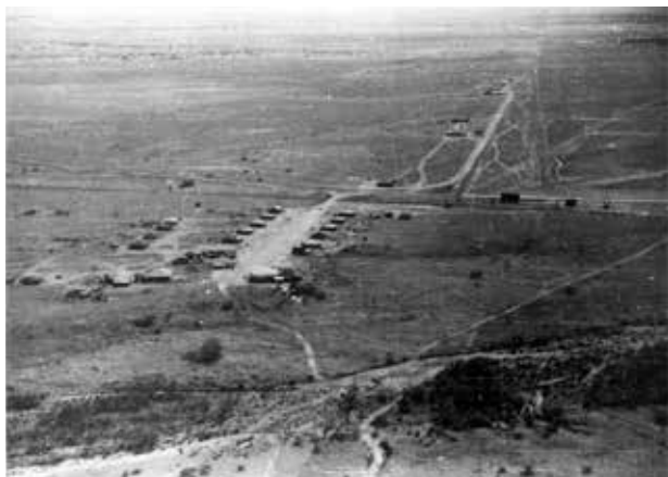
Fry, Arizona c.1939