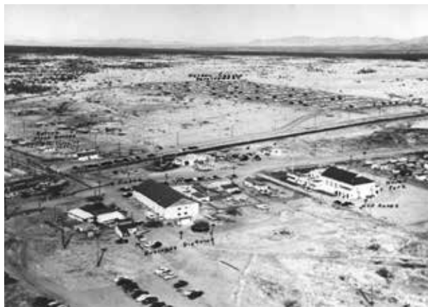
Fry, Arizona c.1955

T HIS EXHIBIT WILL EXPLORE THE EARLY development of Sierra Vista directly outside the gates of Fort Huachuca. Beginning with the movement and meeting of cultures, it will emphasize the Buffalo Soldiers, people of Mexican and/or Yaqui descent, and settlers who formed most of our nascent community. It will also highlight the growth and