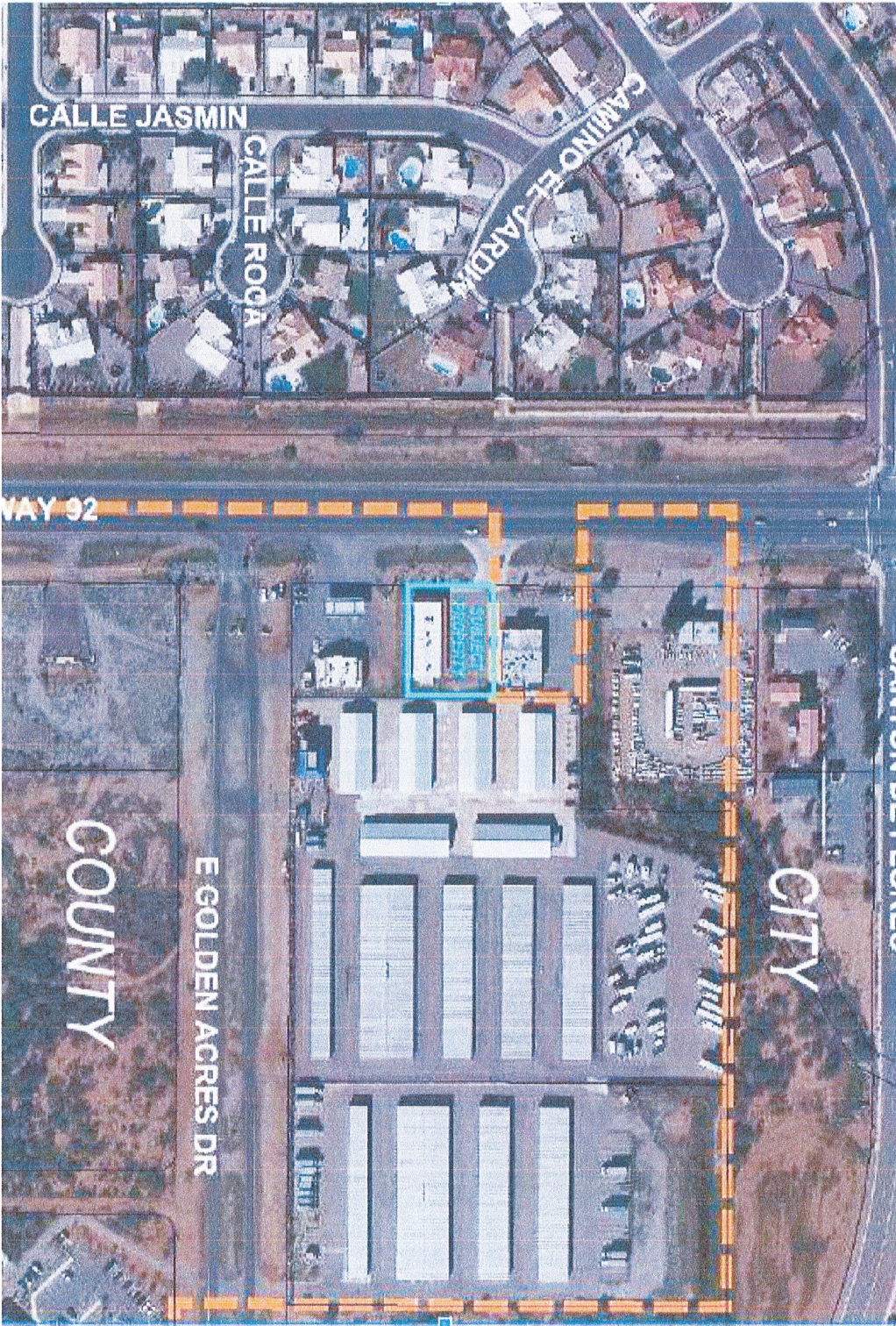
Exhibit A (map)