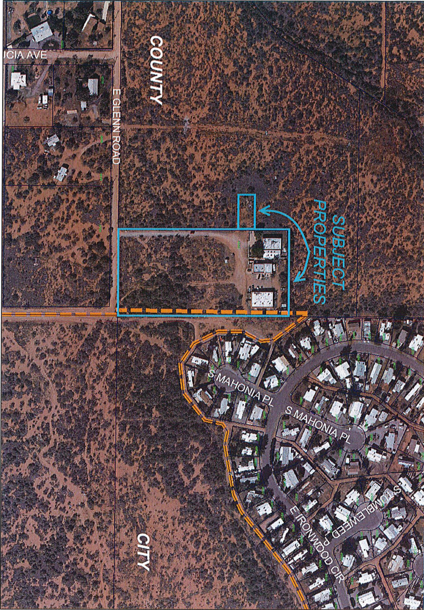
Exhibit A (map)