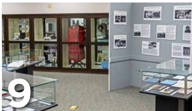
Exhibit Highlights Extraordinary Women

Find out how to recycle live Christmas trees and keep fat, oil, and grease out of your pipes at home.