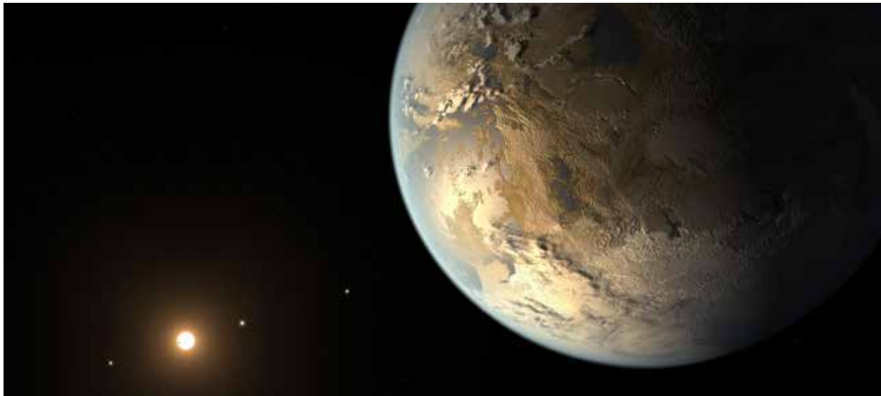
This artist's concept depicts Kepler-186f, the first validated Earth-size planet to orbit a distant star in the habitable zone.