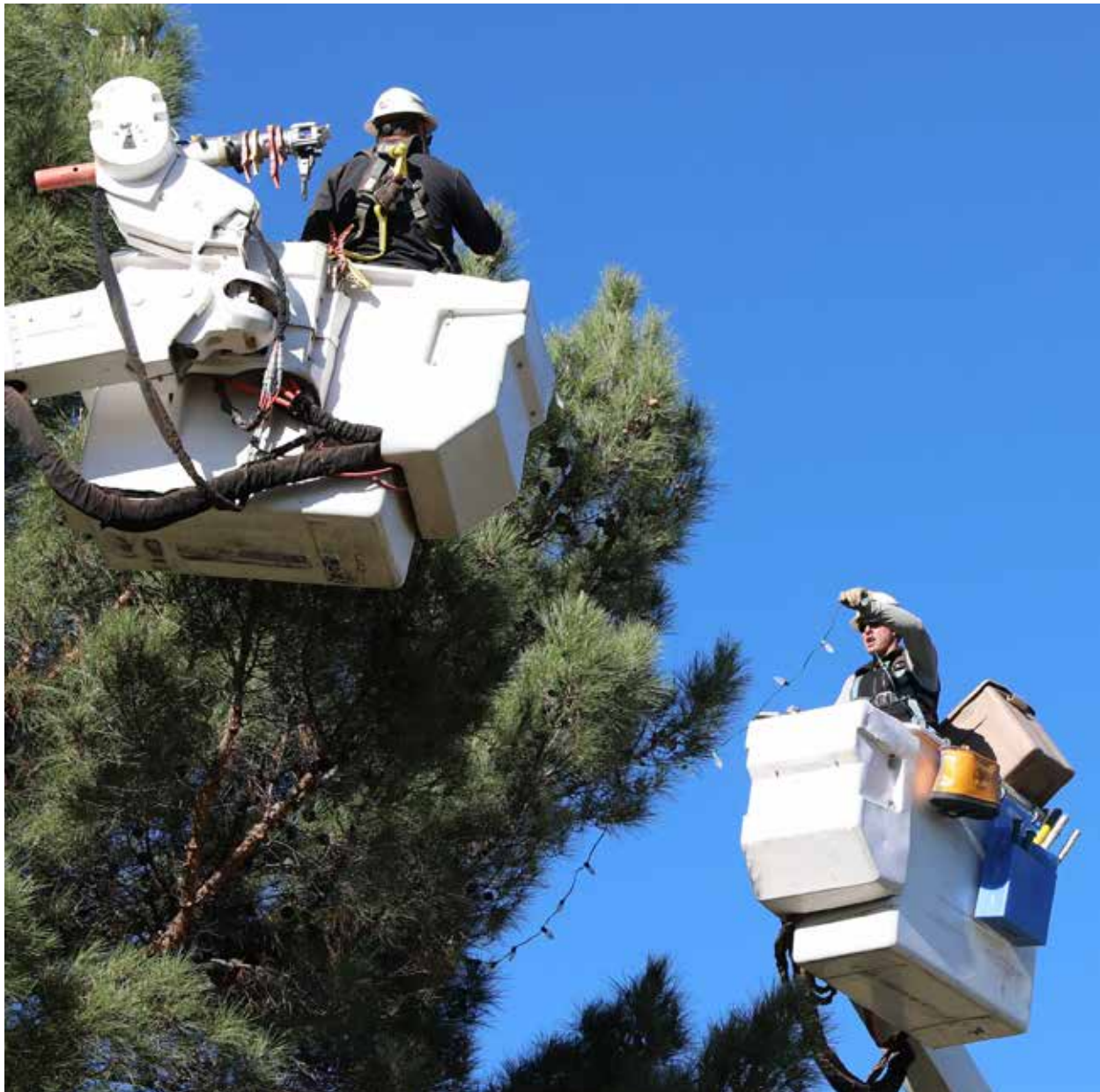
A Sulphur Springs Valley Electric crew adorn the trees in Veterans Memorial Park with holiday lights. SSVEC assists with lighting up the park each year.