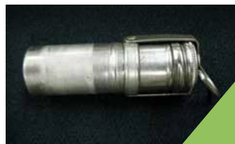
Past artifact: Waterproof Match Safe, ca.1940s