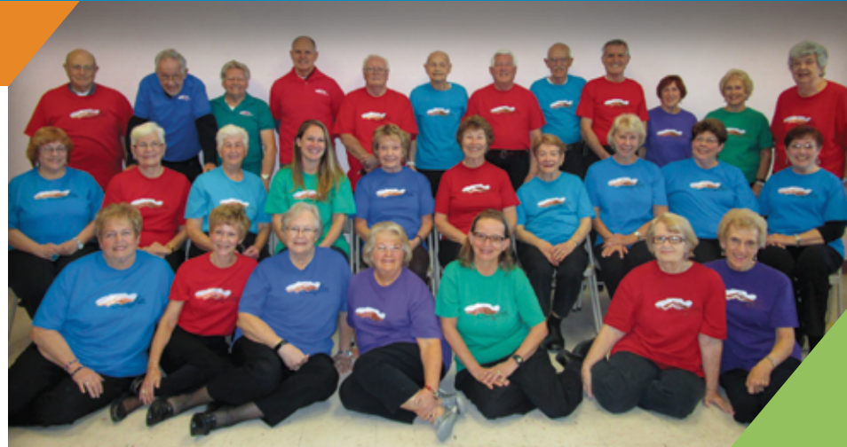
Some proud members of the Sierra Vista Community Chorus ready to raise their voices in the up and coming gospel concert.

The third annual dinner show starts off the holiday season with a bang. Enjoy a wonderful evening of good food, great friends, and wonderful music from the Desert Swing Band. Everyone ages 16 and older are welcome. Dinner, dessert, and beverages are included in the ticket price. Tickets will be on sale November 1 through December 12 at the Oscar Yrun Community Center. For more information, please contact Chris Swan at (520) 439-2300.