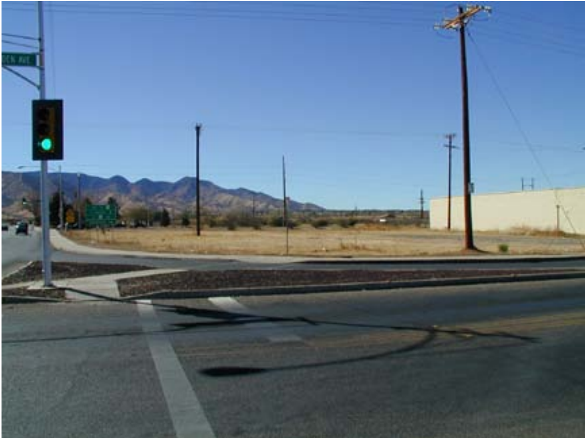
Figure 7: Major Node at the Intersection of Fry and North Garden, looking at Fort Huachuca's Main Gate.

A major node has been identified at the intersection of Fry Boulevard and Buffalo Soldier Trail, or the Main Gate to Fort Huachuca. Figure 7 shows this major node at the intersection of Fry Boulevard and North Garden Avenue looking at Fort Huachuca's Main Gate.