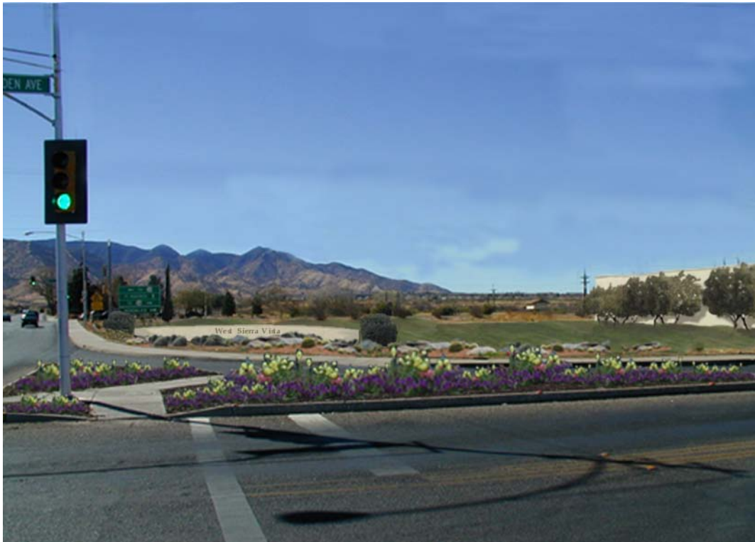
Figure 9: Landscape and signage utilized in the design of a Commercial Entry Feature at the Intersection of Fry Boulevard and North Garden Avenue.

Figure 9 illustrates the use of landscape and signage in the design of a commercial entry feature. A study should be conducted to identify an entry feature theme for the West Sierra Vista area. This study should provide specific design criteria for entry feature design.