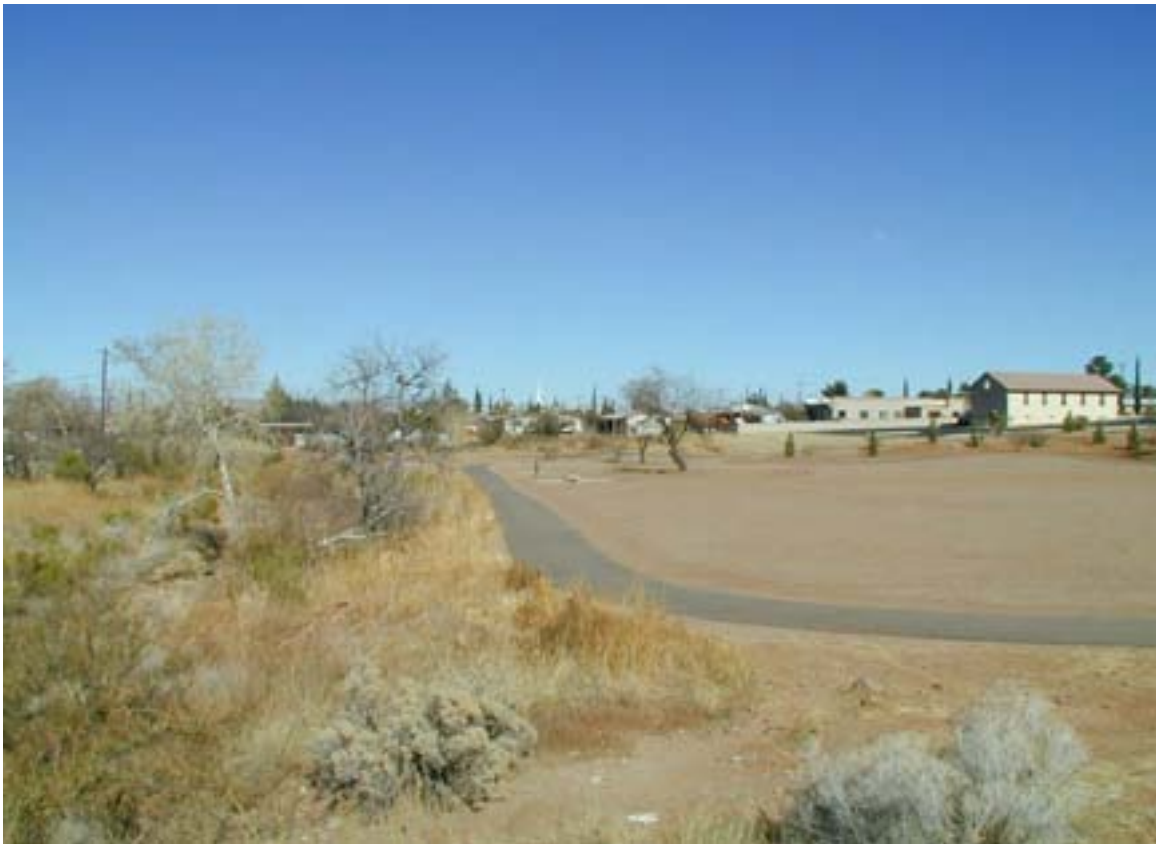
Figure 3: Soldier's Creek Park.

Soldier's Creek Park - Located on the North Planning Area, at the northeastern portion of West Sierra Vista, is Soldier's Creek Park. Currently, this park is undergoing improvements. The West Sierra Vista Strategic Plan , dated July 1998, provides a conceptual plan for Soldier's Creek Park improvements. Figure 3 shows a view of Soldier's Creek Park.