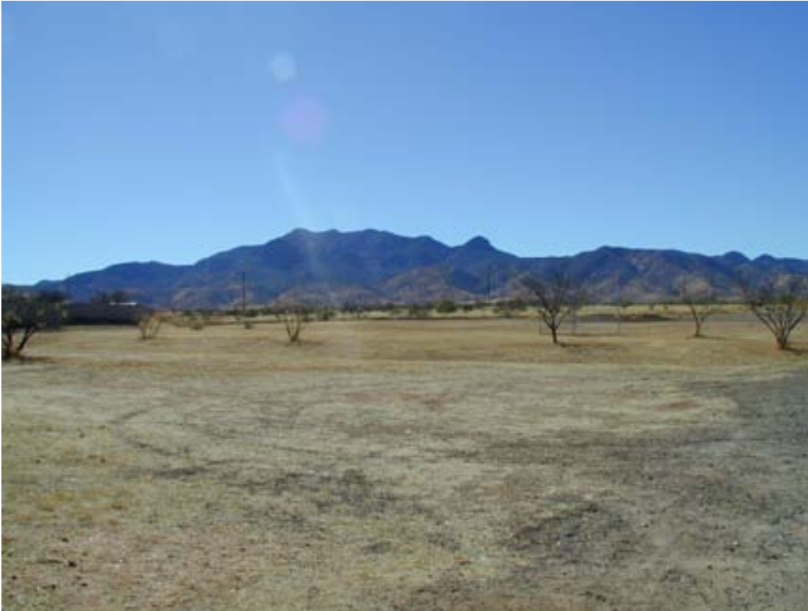
Figure 5: Timothy Lane Park.

Timothy Lane Park – Located on the South Planning Area, at the intersection of Carmichael Avenue and Timothy Drive, Timothy Lane Park serves the surrounding residential areas. This park located close to Golf Links Road at the southern most portion of West Sierra Vista serves as a major open space node along Carmichael Avenue. Figure 5 shows a view of Timothy Lane Park.