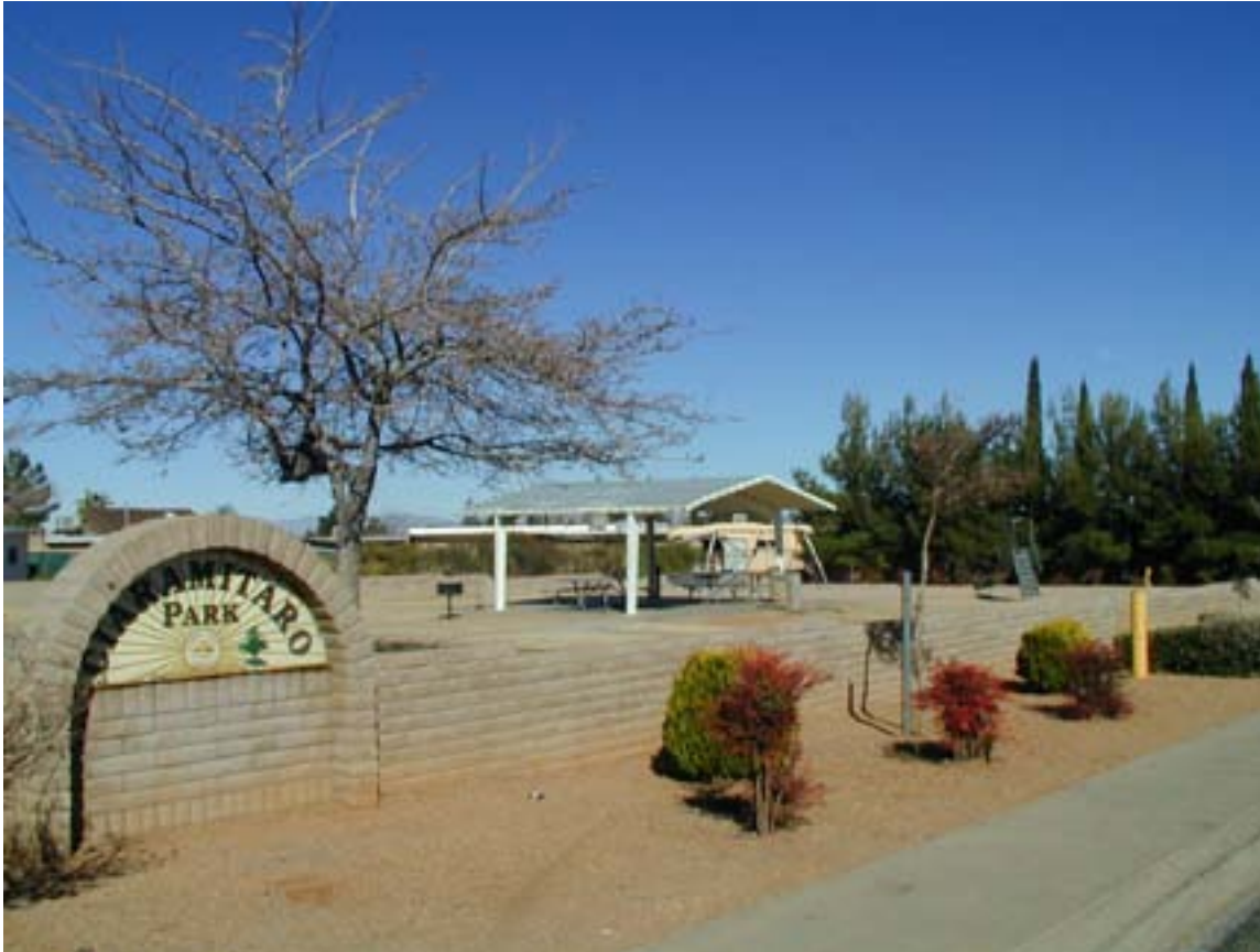
Figure 4: Ciaramitaro Park, Carmichael Avenue.

Ciaramitaro Park – Located on the South Planning Area, at the intersection of Carmichael Avenue and Busby Drive, this small neighborhood park is adjacent to residential neighborhoods and provides a playground area. Ciaramitaro Park is located along Carmichael Avenue, the north-south open space corridor linking most parks within West Sierra Vista. Figure 4 shows Ciaramitaro Park.