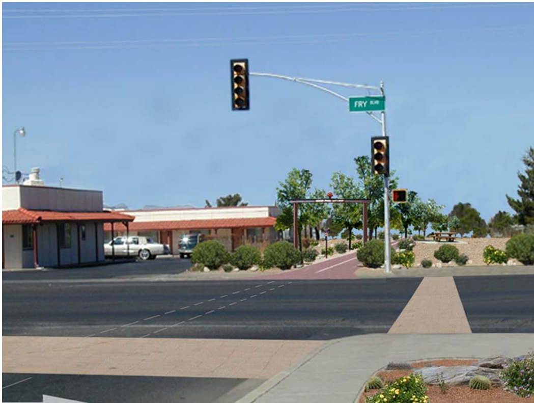
Figure 10: Proposed improvements at the intersection of Carmichael Avenue and Fry Boulevard.

Proper signage at the intersection of Fry Boulevard and Carmichael Avenue could enhance visibility and improve safety. In addition, a residential entry feature is justified at the intersection of Carmichael Avenue and Whitton Street, in the northern edge. Another residential entry feature should be located at the intersection of Carmichael and Myer Drive in the southern edge of the commercial corridor as indicated on Exhibit 10, West Sierra Vista Proposed Circulation Paths and Entry Features. It is also recommended that a pedestrian/bike route be created along Carmichael Avenue and that a linear park be created at the north end of the Carmichael/Fry intersection between the North Planning Area and the Commercial District. Figure 10 shows proposed improvements for the Carmichael Avenue/Fry Boulevard intersection.