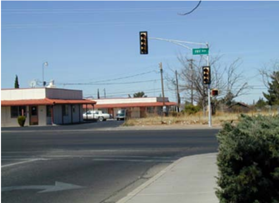
Figure 8: Intersection of Carmichael and Fry Boulevard.

In terms of existing economic patterns, mixed retail, service-oriented businesses and professional offices define the Commercial Corridor. Exhibit 8, West Sierra Vista Commercial Corridor shows existing land uses within this corridor and provides an inventory of existing businesses and services within this corridor.