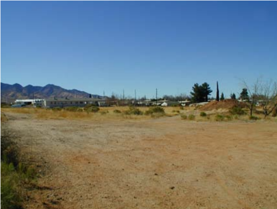
Figure 1: View of the old railroad right-of-way.