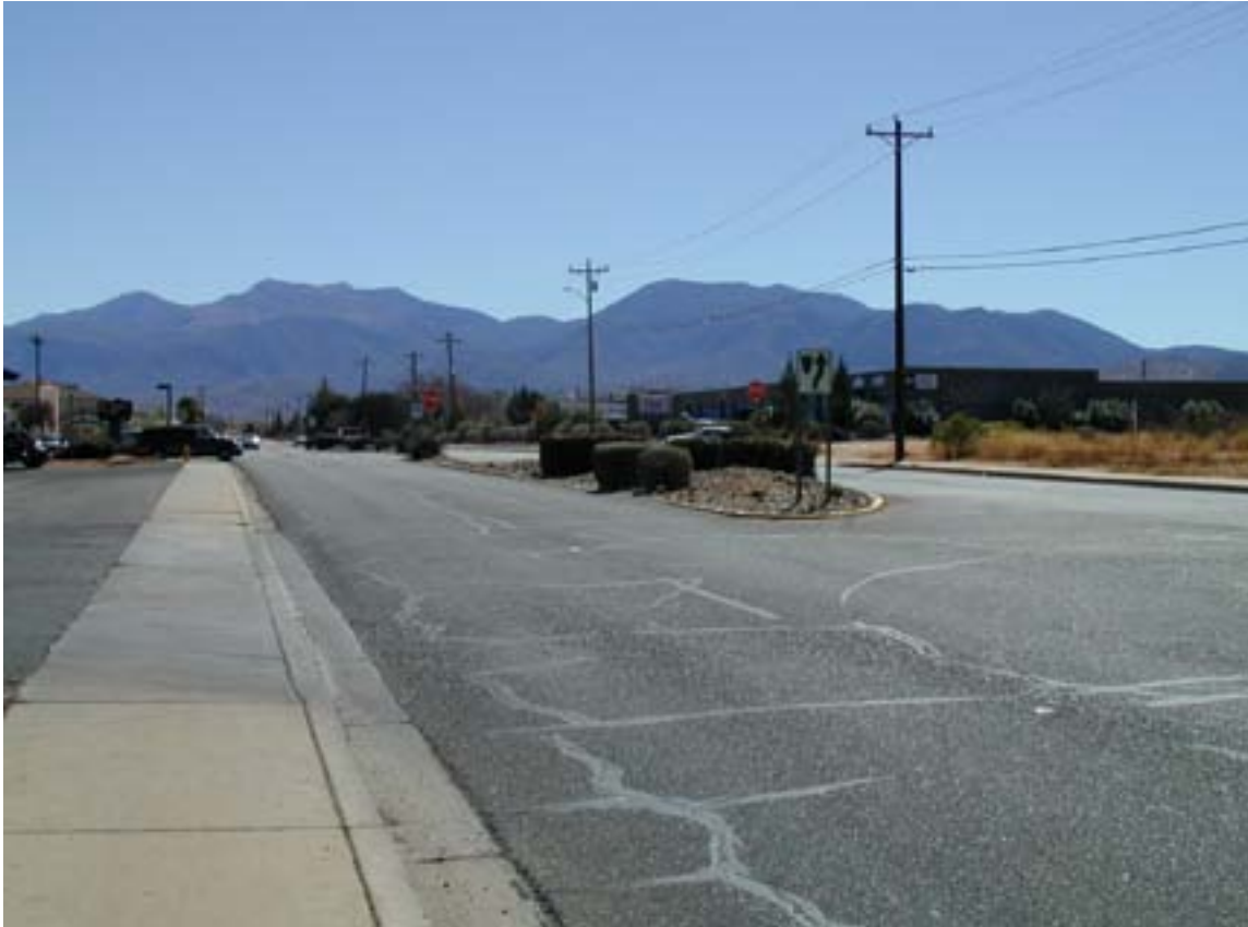
Figure 2: South Carmichael Avenue's landscaped medians.