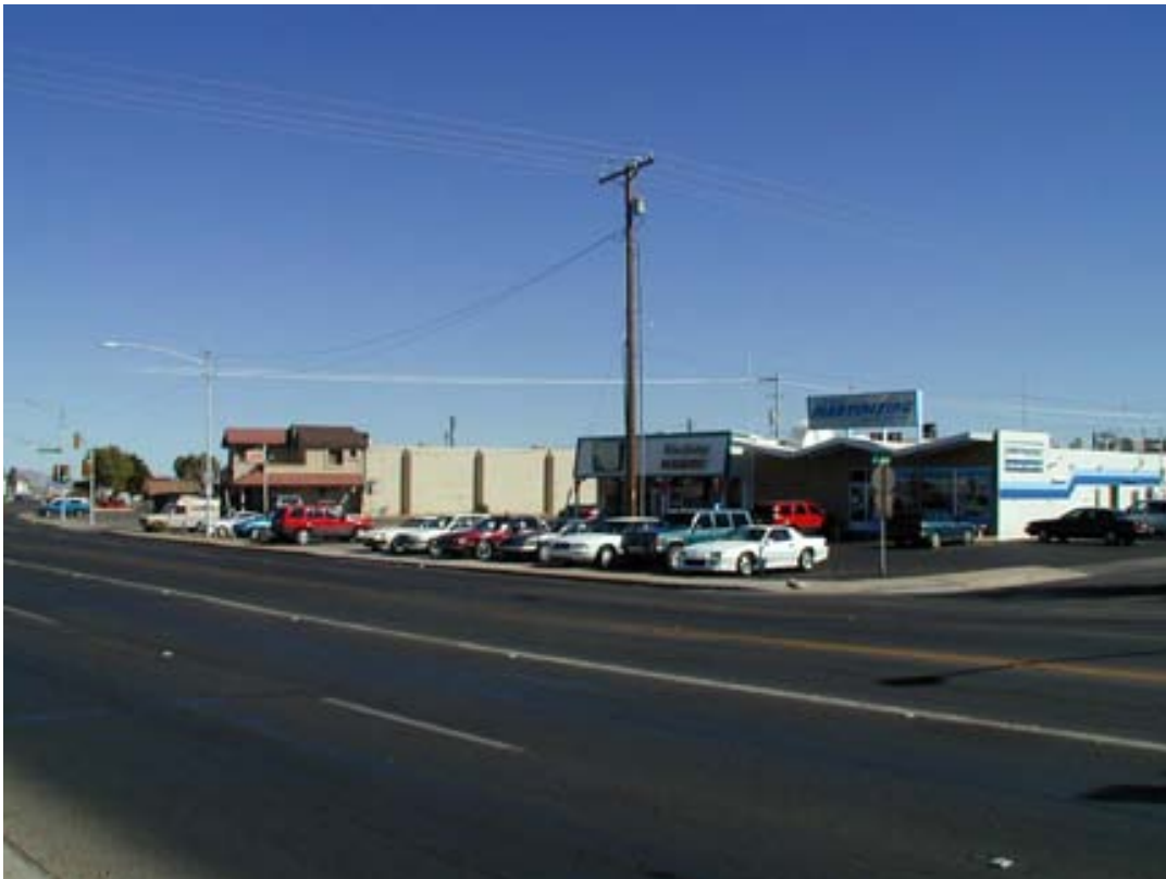
Figure 6: Commercial Strip along Fry Boulevard.

The architecture in West Sierra Vista varies only slightly in styles and materials. For the most part, architectural styles and features of commercial buildings in West Sierra Vista are characteristic of the 1950s flat roof structures and strip malls. Most of the buildings are constructed out of brick or block and contain frame windows. Figure 6 shows a typical block along Fry Boulevard. The heart of the corridor is a seven-block stretch of primarily one-story buildings with some two-story buildings along Fry Boulevard.